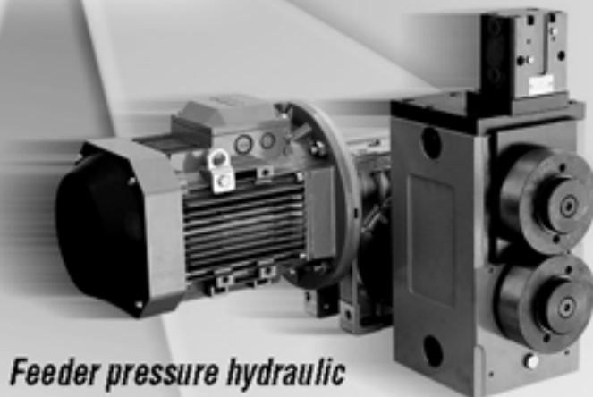
Feeder pressure hydraulic

Steel or plastic type rollers Rollers profiled to your wire, rod or flat bar specification Motor or pulley driven