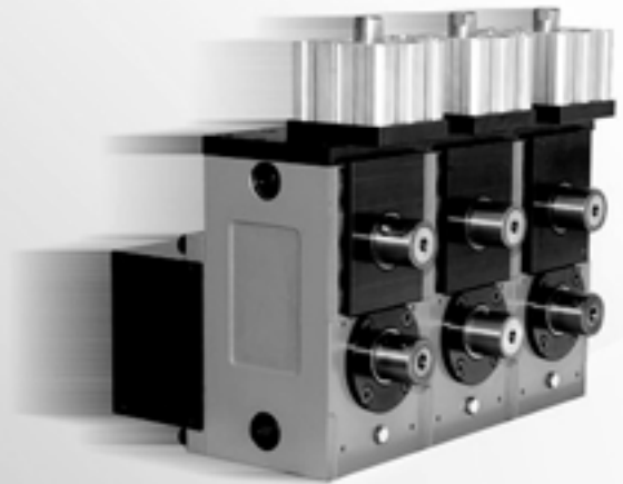
Feeder pressure pneumatic

1, 2 & 3 module units Various roller presssure adjustment options:- - cam, screw, pneumatic & hydraulic - for wire dia. 1 - 15 mm (0.039" - 0.60 ")